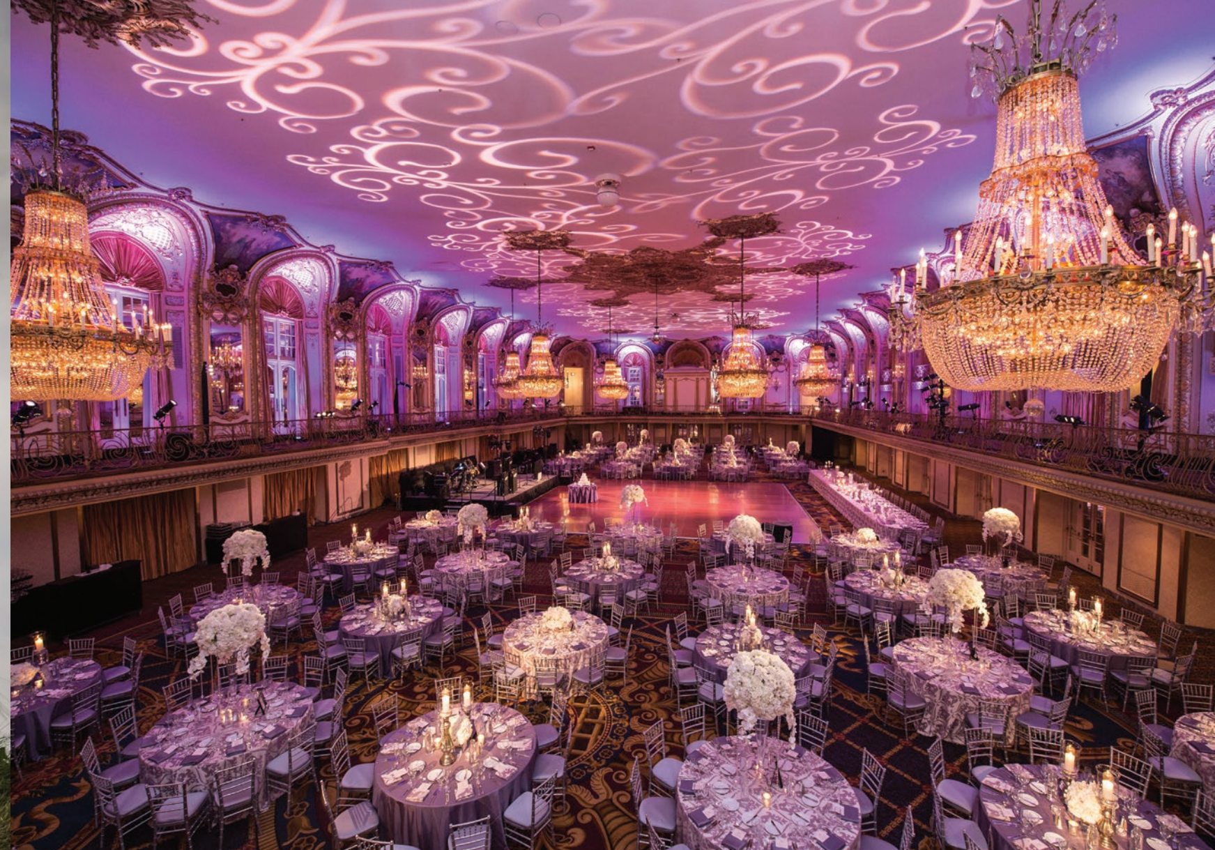
One of the breathtaking, glamorous events organized by Michelle Durpetti Events

"It was such a joy to see the event grow from a one-day event to a three-day long weekend