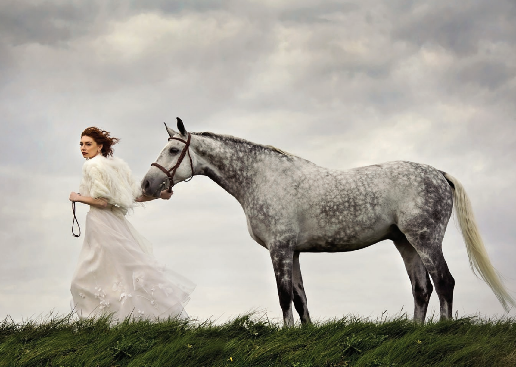
A second gorgeous photo from the creative wedding-themed photoshoot at Canterbury Farm in Hampshire, IL

makes us a resource and tool for each and every one of our clients."