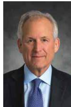
W. James McNerney, Jr. Chairman, President and CEO

The United States Equestrian Team Foundation (USET) is a philanthropic partner of US Equestrian (USEF). The USET Foundation funds U.S. teams and programs through charitable gifts and donations and makes grants to USEF annually.