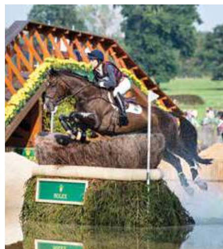
Ariel Grald and Leamore Master Plan

The U.S. team finished on a team total of 116.5, just 0.3 penalties behind the first-place finishers from Great Britain.